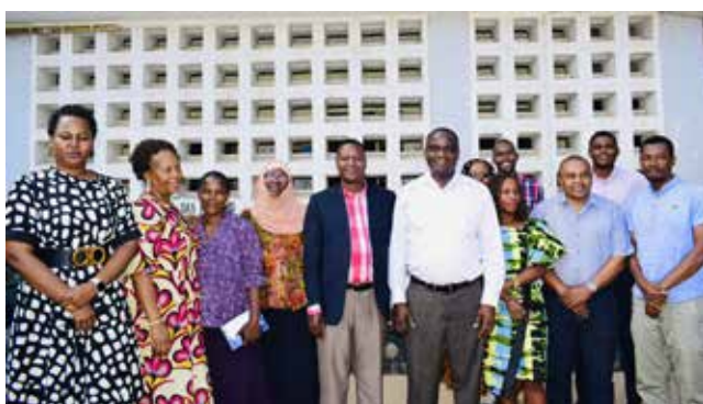
Group photo of Officials from RMO's office and representatives from Pharmacy Council.