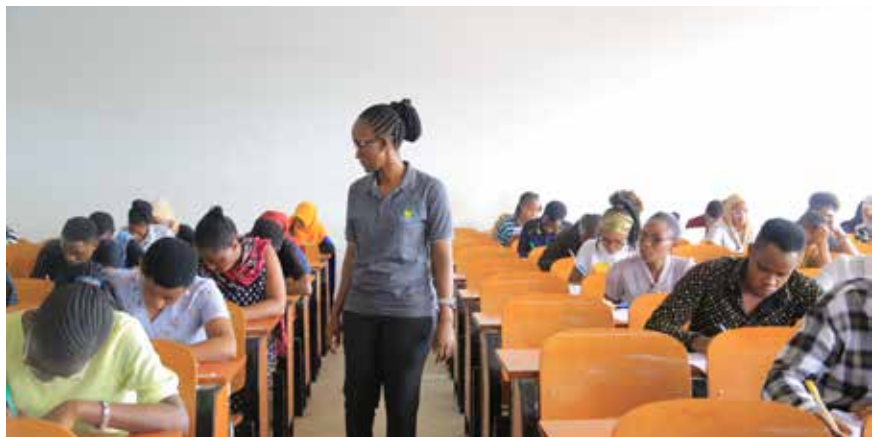
Candidates who sat for pre-registration and professional examination in Dar es Salaam at Tanzania Institute of Accountancy (TIA) centre.

The Deputy Registrar stated that the examinations are very important in determining the competency of graduates who are intended to be registered by the Council and allowed to practice as pharmaceutical personnel.