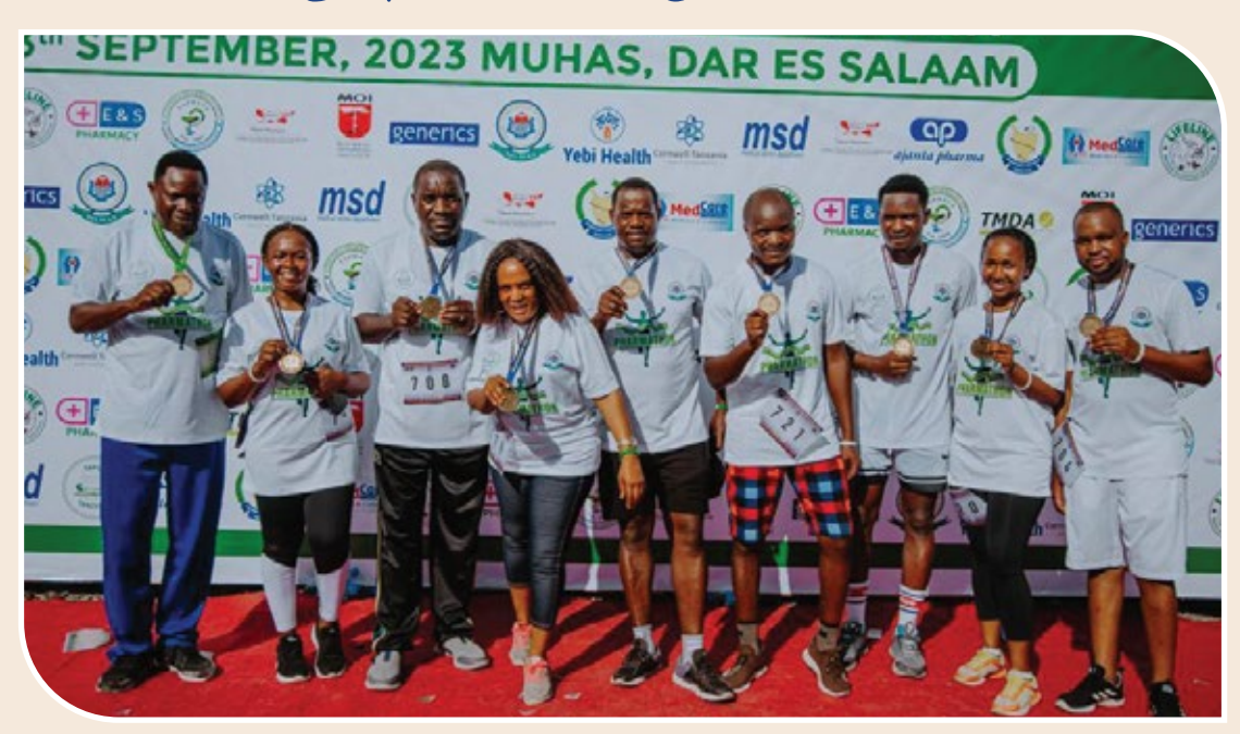
"Walking is the best way to get fit, and it can be so inspiring when you walk for a beautiful purpose". Pharmacy Council staff representative during the WALKATHON organized by TAPSA in September, 2023.