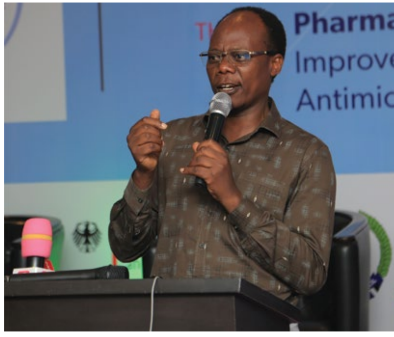
The Deputy Minister of Health Hon. Dr. Godwin Mollel addressing various health professionals during the meeting organized by the Christian Social Services Commission (CSSC) on 25 September, 2023

he called on pharmacists to adhere to the ethics and guidelines that govern the profession in their workplaces.