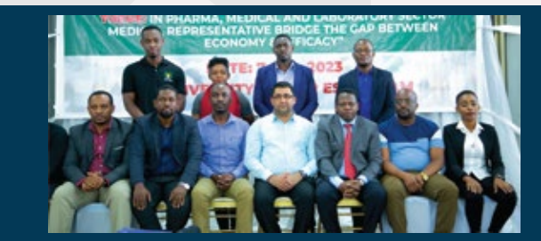
Pharmacy Council Secretariet in a group photo with Association of Medical Representatives in Tanzania (AMRET) during AMRET's General meeting held in Dar es Salaam July, 2023

The Registrar continued by saying that, she recognizes that the medical representatives in the country are regulated in accordance with Section 46 of the Pharmacy Act, and emphasized the importance of the association to be regarded as a reflection of ethical and professional conduct to medical representative to the just as in other countries. She added that the pharmaceutical industry is growing and therefore need to be protected and respected.